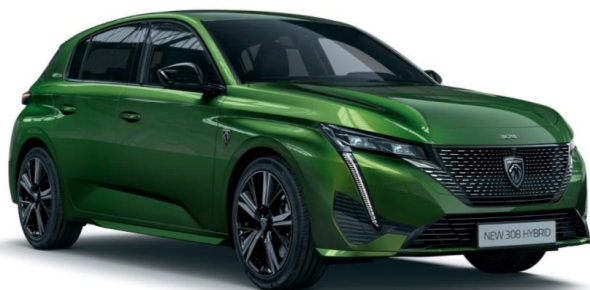
308 & 308 SW