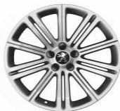
18" 'original' - dark grey