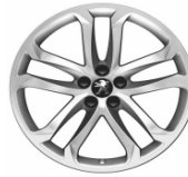
19" 'solstice' anthra grey