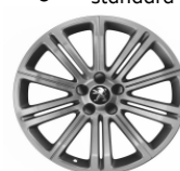
18" 'original' - spirit grey