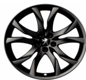
19" 'Sortilege' midnight silver