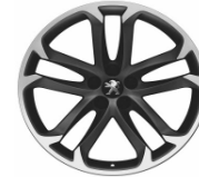
19" 'solstice' onyx black