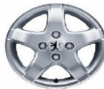
14" Magda alloy wheel