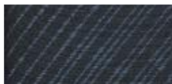
Mistral Blue / Grey trim (SE level)