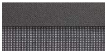
Transcodage trim (S level)