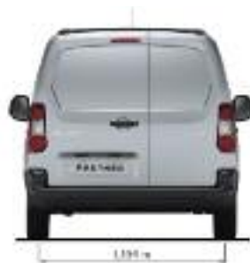
(1) Version longue.